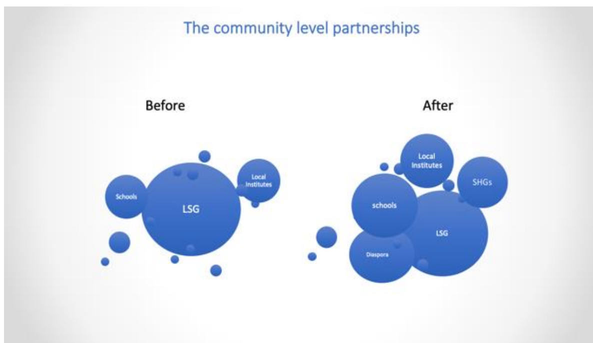
Figure 2. Community partnerships before and after the project delivery