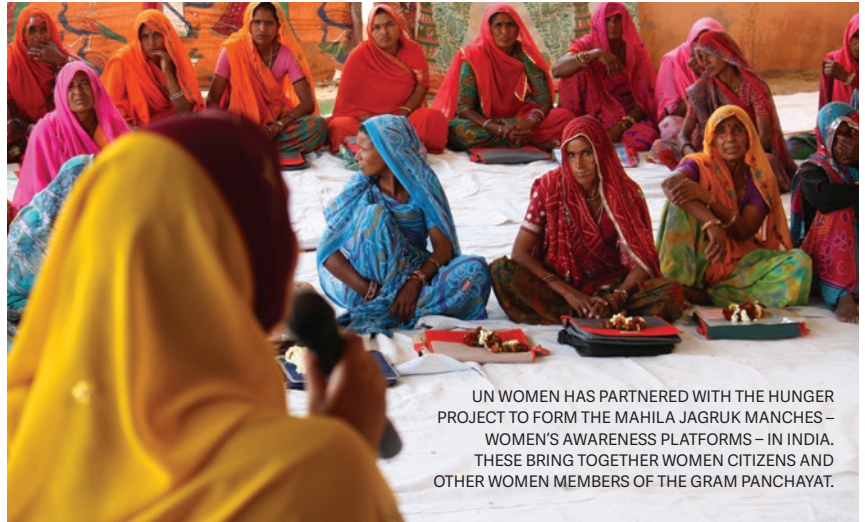
UN WOMEN HAS PARTNERED WITH THE HUNGER PROJECT TO FORM THE MAHILA JAGRUK MANCHES – WOMEN’S AWARENESS PLATFORMS – IN INDIA. THESE BRING TOGETHER WOMEN CITIZENS AND OTHER WOMEN MEMBERS OF THE GRAM PANCHAYAT.