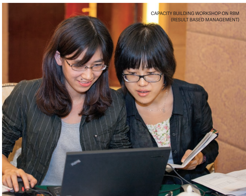
CAPACITY BUILDING WORKSHOP ON RBM (RESULT BASED MANAGEMENT)

These factors reportedly led to reprogramming, no-cost extension requests, return of unspent funds to donors and reduced the quality of some outputs as there was insufficient time to carry out the activities which had been designed for a longer period of time. In line with this, multi-year funding arrangements were cited as one facilitating factor to ensure achievement of a more sustained and empirically demonstrable impact.