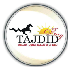
Tajdid - which specialises in GBV and economic empowerment for women