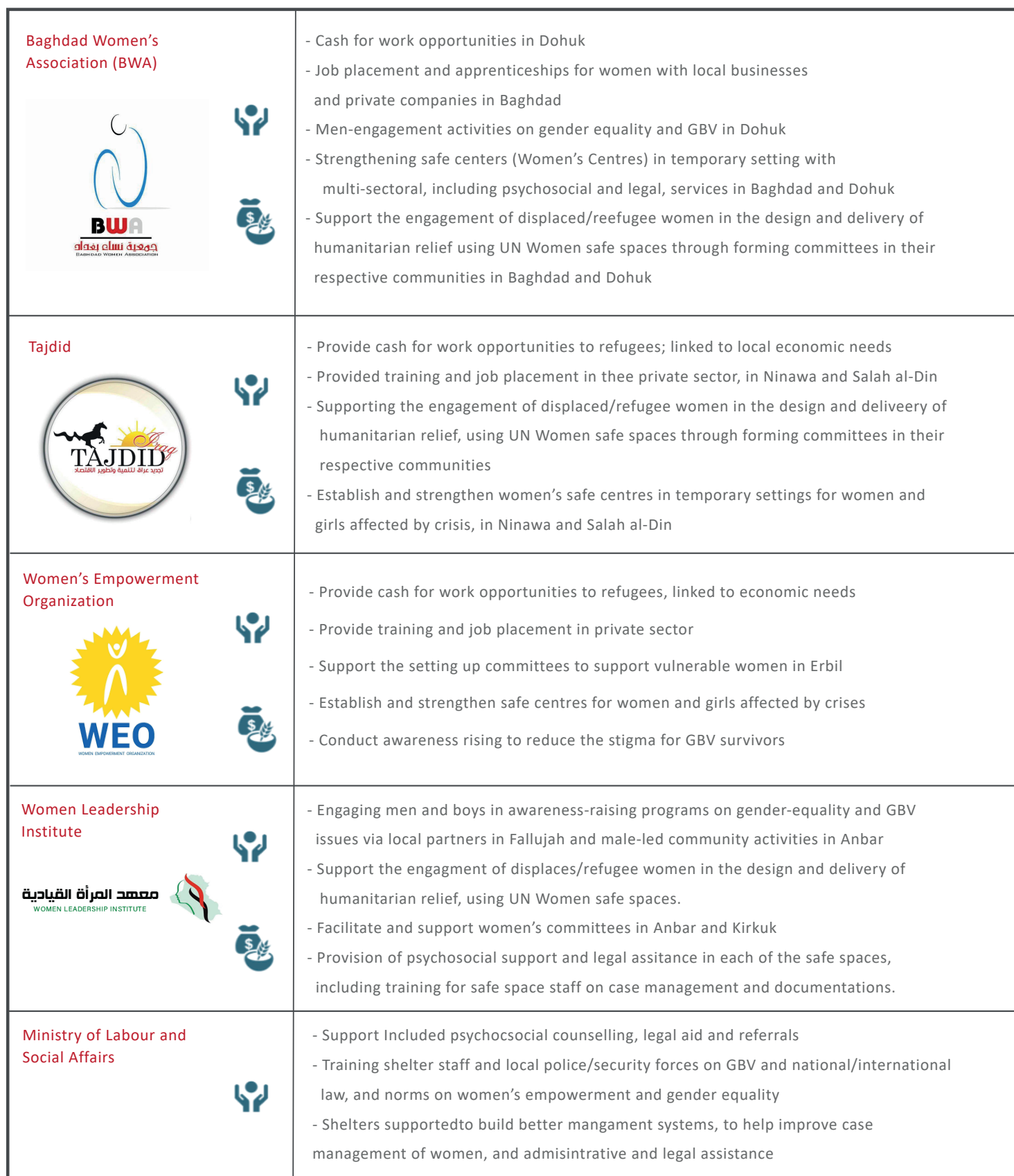
Table 1: UN Women core Madad partners and activities in Iraq