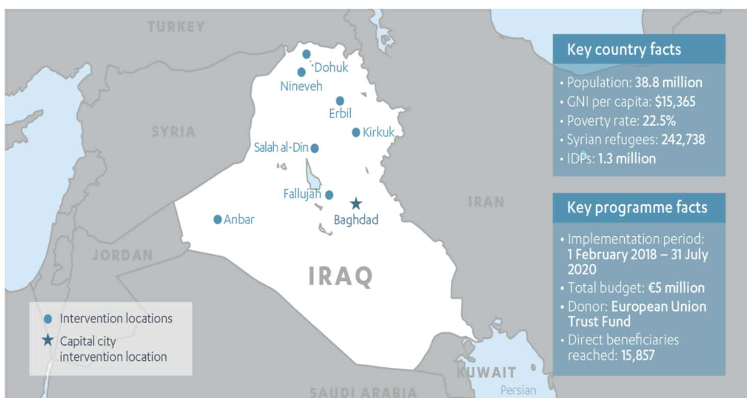
Figure 1: The UN Women Madad programme in Iraq: key facts and locations

This country summary report presents the findings and recommendations of the independent evaluation of UN Women's Strengthening the Resilience of Syrian Women and Girls and Host Communities (Madad) programme in Iraq. The country summary is an annex to the main synthesis report covering the regional programme in three countries. For an account of the evaluation approach, methods and questions, please refer to the main report and relevant annexes.