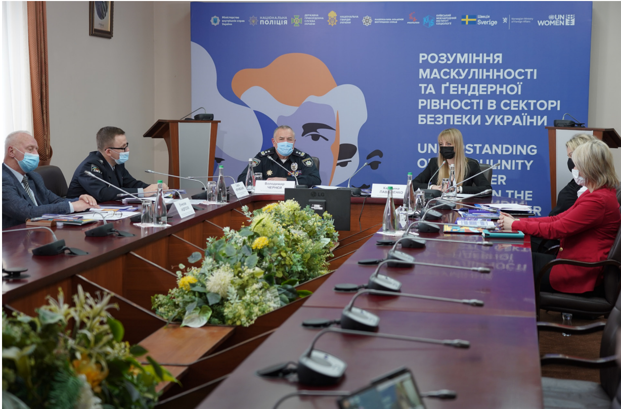
Deputy Minister of Internal Affairs of Ukraine Kateryna Pavlichenko is presenting the results, conclusions and recommendations of the Masculinity Study in the Security Sector of Ukraine, 25 March 2021, Kyiv, Ukraine.

In general, the project captured well the outputs, or tangible results, of its interventions but has inconsistent mechanisms and practices to record and analyse outcome measures (both short-term and intermediate-term) that are the effects or impacts of the outputs. Results-based management has not been fully implemented through the planning, achieving and demonstrating results stages, with main gaps in setting measurable baselines, targets and indicators and the effective monitoring of project strategic results and impact on the ground.