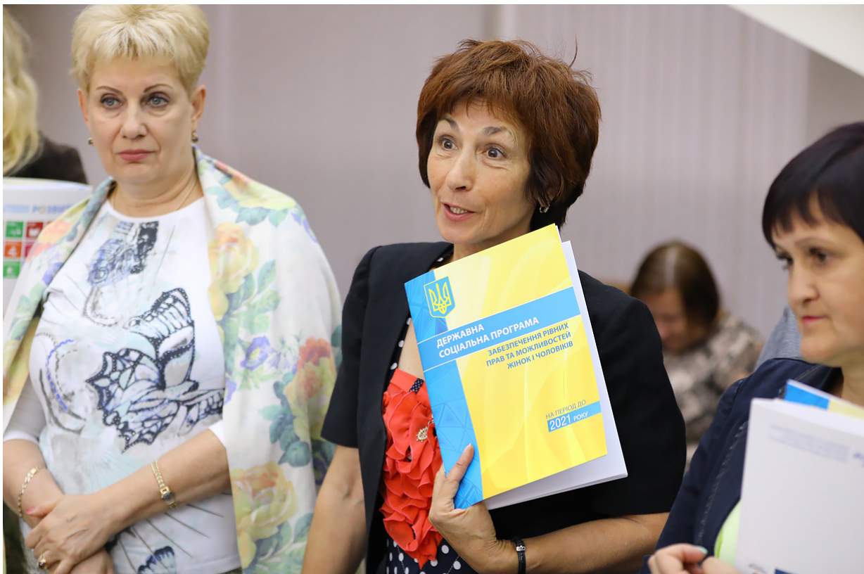
Grass-root women activists discussing the State Social Program on Equal Opportunities For Women and Men, Consultative meeting of Deputy Prime Minister for European and Euro-Atlantic Integration of Ukraine with the regional state administrations and local hromadas, 17 September 2018, Dnipro, Ukraine.

The project partnered with a wide range of stakeholders from the Government of Ukraine, civil society and