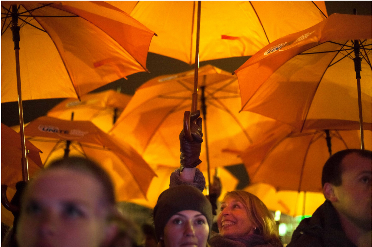
Women and men gathering together in the city centre to mark the start of the 16 Days of Activism against Violence towards women and girls, Kharkiv, 25 November 2017, Kharkiv.

by February 2022. The UN Women project did not support the implementation of strategies and policies on the ground through piloting or developing operational protocols and other instruments, which limited the impact of the project on the final beneficiaries. In the evaluation team's assessment, the project overemphasized the policy development stages at the expense of supporting the policies' proper implementation. Ownership has also been considerable at the Office of the Deputy Prime Minister for European and Euro-Atlantic Integration, the Ministry of Defence, the Ministry of Foreign Affairs, the Ministry of Internal Affairs, the Ministry of Social Policy and the National Agency for Civil Service. For some other counterparts, the long-term effectiveness was less certain. The project succeeded in delivering results with transformative potential in a number of areas, such as by contributing policy advice to the first Voluntary National Review on the SDGs, the Roma Strategy and its Action Plan; supporting gender audits/assessments in a number of ministries; promoting disaggregated gender equality monitoring indicators; and