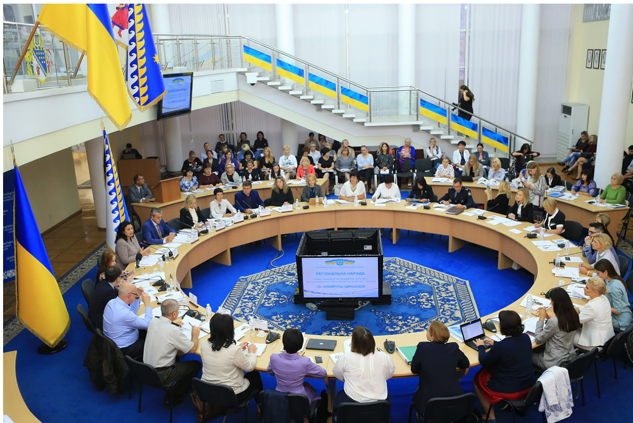
Plenary session of the Consultative meeting of Deputy Prime Minister for European and Euro-Atlantic Integration of Ukraine with the regional state administrations and local hromadas, 17 September 2018, Dnipro, Ukraine.

The evaluation applied a non-experimental theory-based contribution methodology. As the project was heavily focused on policy advice and advocacy, the evaluation team reconstructed the project theory of change and used it as the overarching theory to understand how changes happened at the strategic and operational levels. Contribution analysis was used to develop an overall performance story and assess plausible project contributions to the observed changes. A mixed-methods approach was applied, involving a blend of qualitative and quantitative data collection methods such as a desk review, interviews,